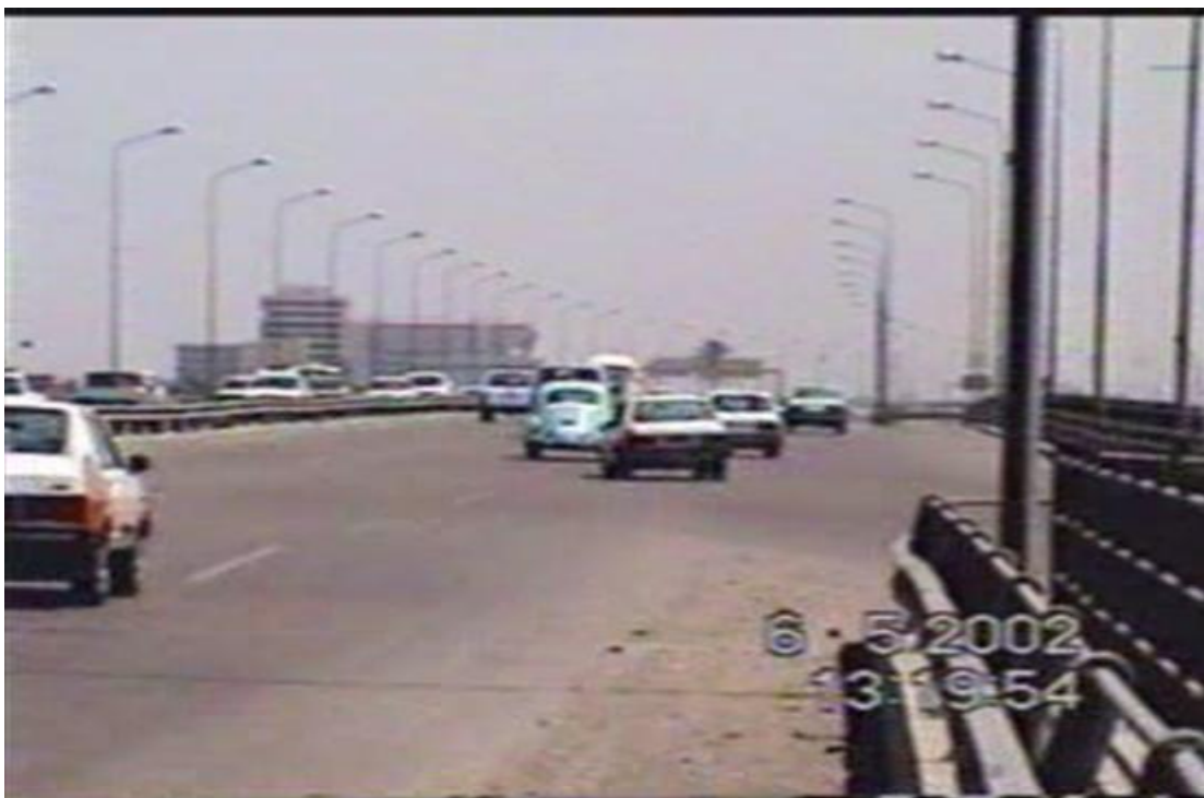
Figure (6): On site picture for Mohamad Al-Qasim highway showing the gap acceptance process for on ramp vehicle to the second lane directly.