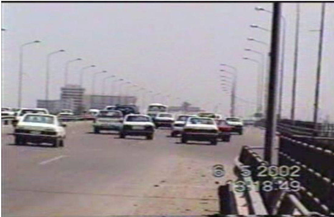
Figure (5): On site picture for Mohamad Al-Qasim highway showing the gap acceptance process between two adjacent lanes.