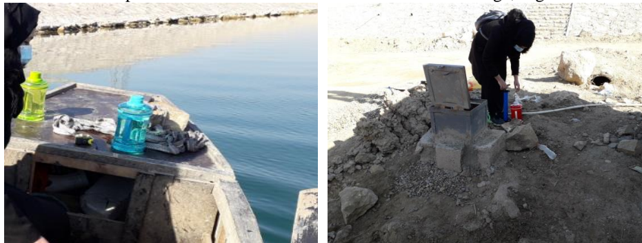
Fig. 2. Water extraction process from three wells and AL Warrar canal

Depending on the data of three wells drilled in the right bank to Al Warrar canal in Al-Ta'meem district. 95 water samples of the same depth were collected from five different sites (19 samples each). The sample collection procedure conducted on January/ 1 st 2021 between 11 and 12 pm. The five sites were distributed as follows: three of these sites are wells that have been drilled, and the other two sites are in the middle and on the canal bank. Sample storage was done by using high-quality plastic bottles tightly closed and kept at 4^{\circ}\text{C} before the test process. These samples tested in the laboratories of the Science College, Fig. 2.