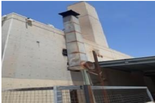
Fig. 3 Incineration

The shredding machine with microwave is accessible in Al-Ramadi hospital, although it is currently not in use due to a shortage of skilled operators. This technical treatment procedure necessitates qualified personnel with high-pressure steam system maintenance expertise. The capacity of the shredder at Al-Ramadi hospital is 30 to 35 kg/cycle, with cycle duration of 40 minutes. The machine operates with a minimum of 16 kg of medical waste and heats the trash via microwave depending on the rise of wave frequency from 50 to 2000 HZ. The produced temperature is around 106 °C; at this temperature, medical waste is transformed to regular garbage by heating. Shredding is the process of reshaping or cutting garbage into tiny pieces so that it cannot be identified. This technique aids in the avoidance of bio-medical waste reuse and also acts as a means of showing that the waste has been decontaminated and is safe to dispose of [Babanyara et al.]. For outdoor transportation, a well-designed trolley with appropriate standards is employed. Although this truck is identical to a solid waste vehicle, off-site transportation vehicles are not labeled with the carrier's title and company.