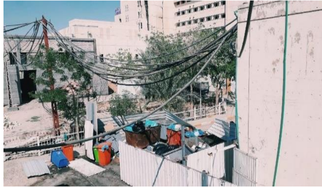
Fig. 2 Uncontrolled storage areas of healthcare waste near the hospital

The garbage collection station is around 50 meters distant from the hospital. A steel structure supports the containers on the outside. These waste containers are designed to be easily loaded, easy to push and pull, with different sizes to accommodate up to 50 kg waste, with a height similar to waste containers to facilitate minimal agitation and avoid spillages, to a specific waste type, easy to clean and disinfect, and remain secure during transportation. Figure (2) depicts an unregulated hospital waste storage space, yet uncovered and overflowing mixed trash was seen.