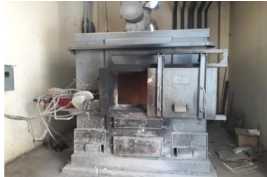
Fig. 4 Combustion single chamber